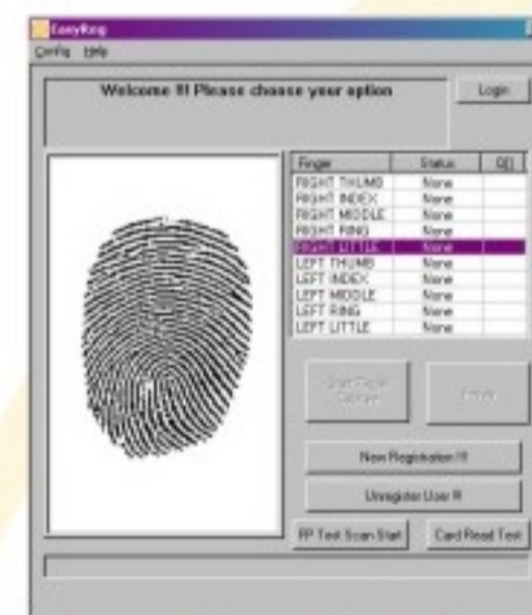
Screenshot of EasyReg Desktop Software