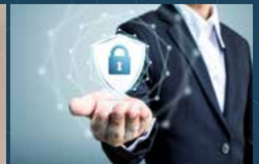
TERMINAL SECURITY SOLUTION

CONNECT WITH US TODAY FOR A SECURE BANKING TOMORROW Email: marketing@vortexindia.co.in