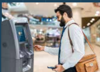
FRONT LOAD ATM